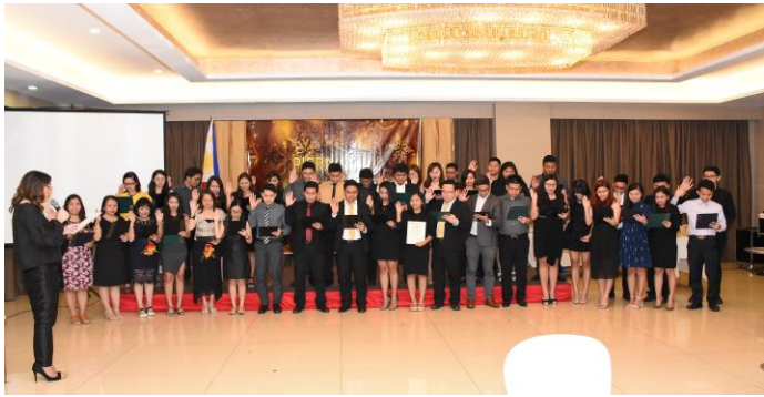
Committee Chairs and Members sworn to oath during the Induction of Committee Officers last July 29 at the Mandarin Plaza Hotel