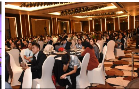
Snaps from the 5 th PICPA Cebu Summit held at Marco Polo Plaza Cebu. In the said event, the Chapter Officers were inducted into office.